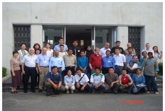
Some students and some staff enjoy a visit to the prefecture's Police Academy

Graduates received diplomas and (courtesy of the Tokiwa International Victimology Institute) a CD containing a compilation of lectures and students' presentations, as well as photographs.